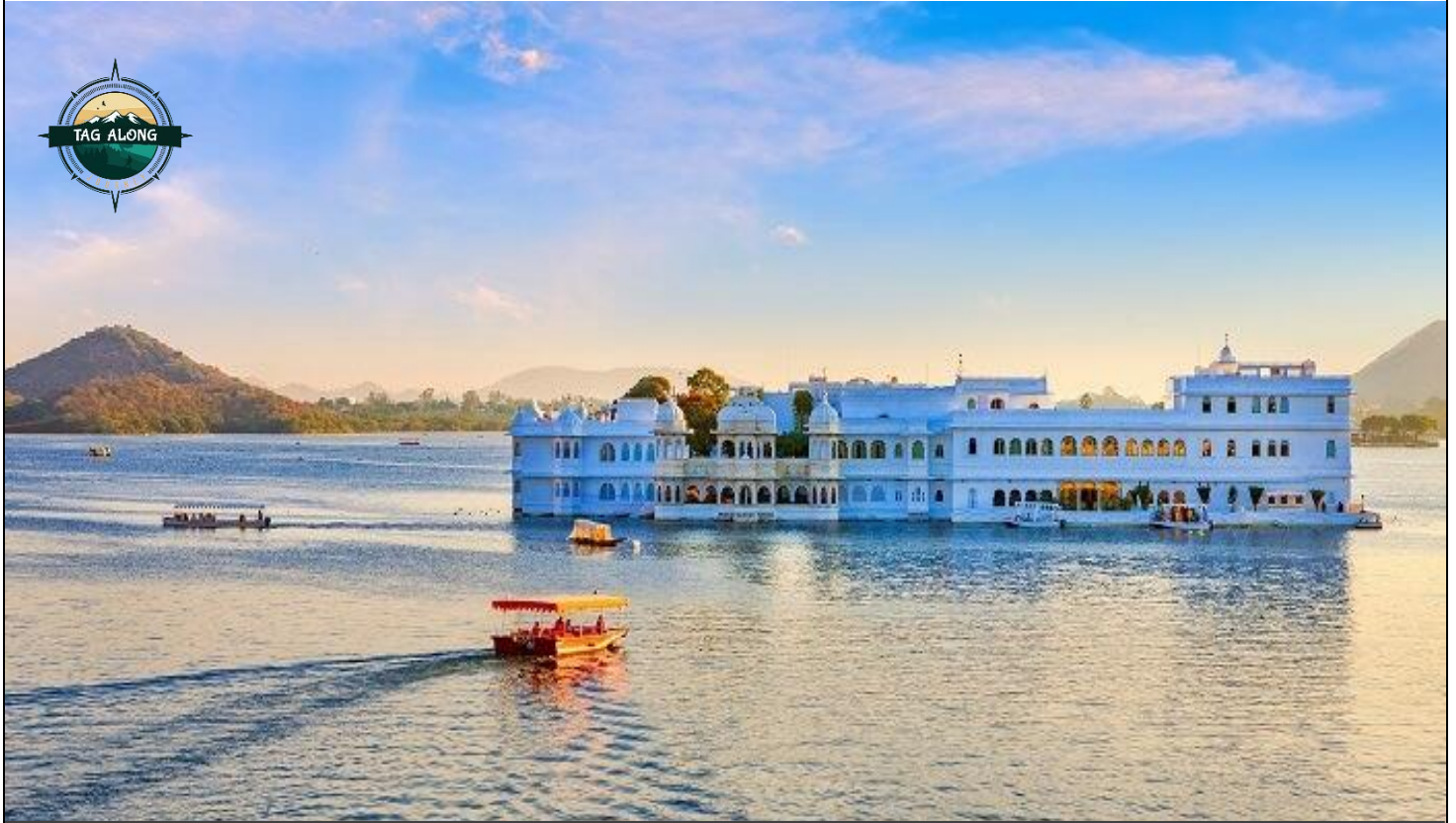
UDAIPUR - KUMBHALGARH